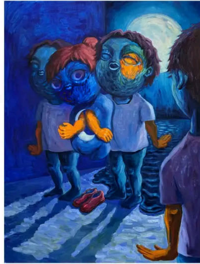
OH WELL, THE TRUTH IS..