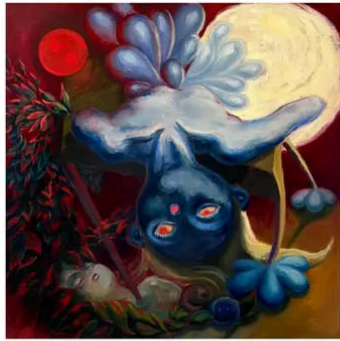
NIGHT AND I AND SMALL ANIMALS