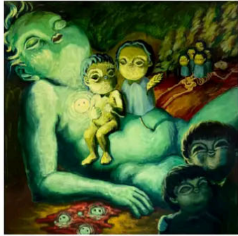
CHILDREN OF BAIT