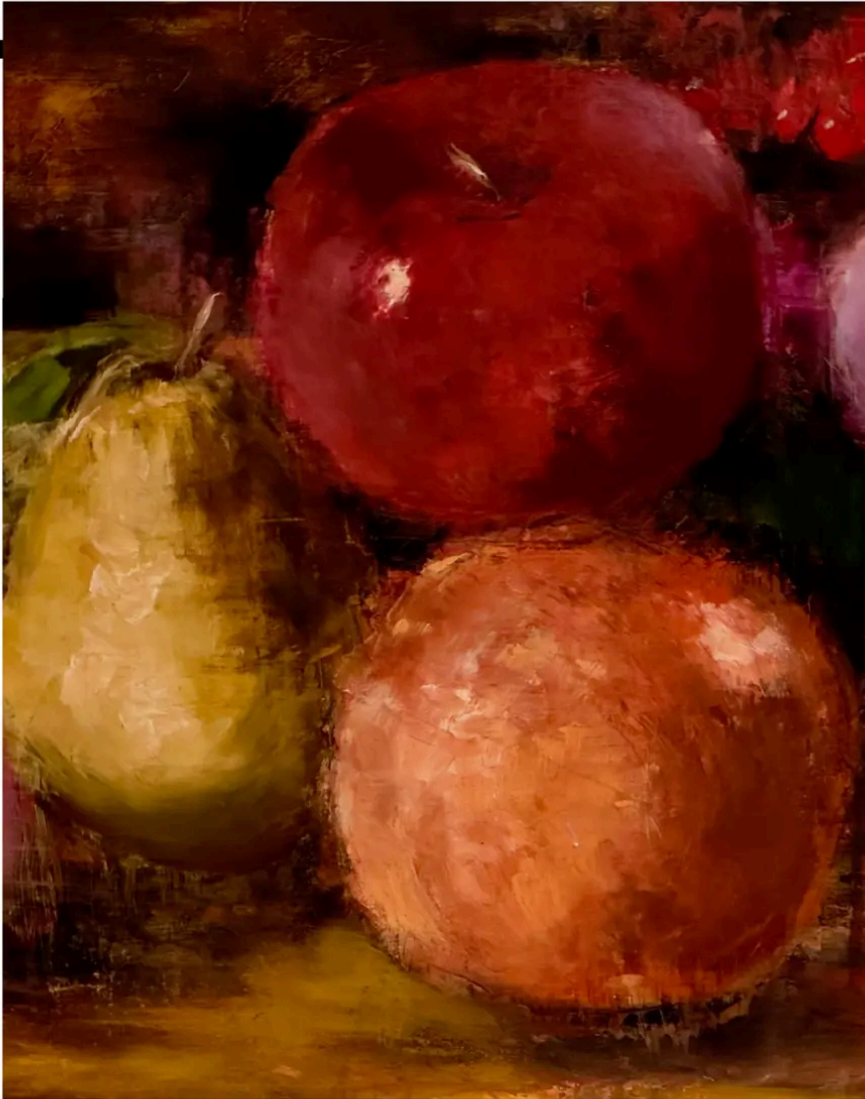
"NIGHT FIGS" ANN-MARIE BROWN